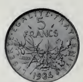
Lot No. 2742

2742 1984. 5 Francs, KM P764, mintage 4 pieces. Satin finish Proof, handsome golden toning; the obverse is quite bright. Really a choice specimen. 38.9 Grams.